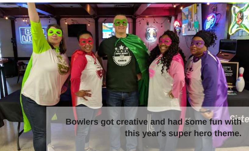
Bowlers got creative and had some fun with this year's super hero theme.

The biggest night of the year features a one-of-a-kind show presented by Littles in the Big Brothers Big Sisters program. We were honored to have Founders Advisors as our presenting sponsor of the event. This year's event was held at The Club. Guests enjoyed a silent and live auction and live music.