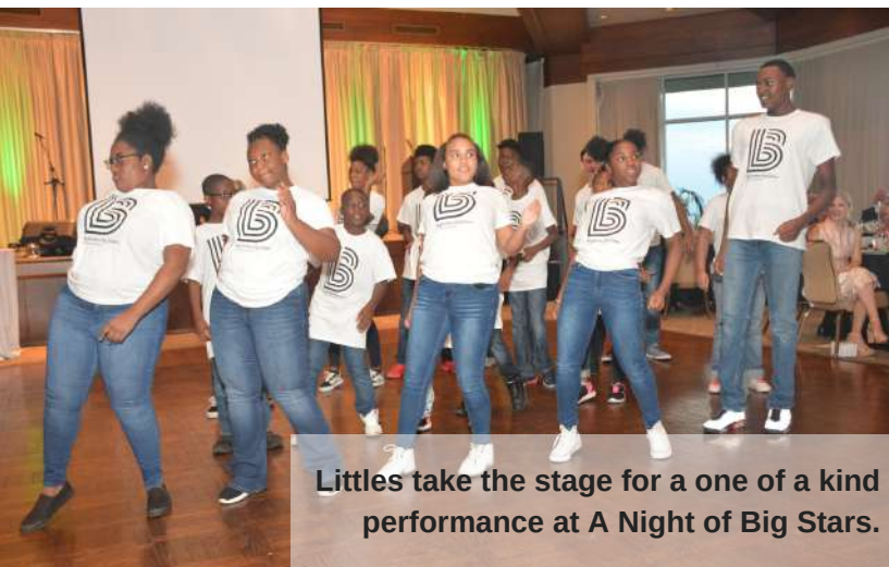
Littles take the stage for a one of a kind performance at A Night of Big Stars.

Our events find fun ways to raise money and help create a buzz about what we do. We have three signature events that bring in almost one third of our annual budget and help us connect even more people in our community to our mission.