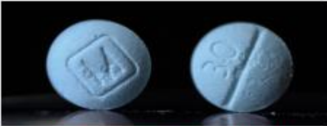
Authentic oxycodone M30 tablets