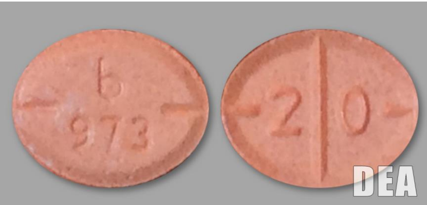
Authentic Adderall® 20mg