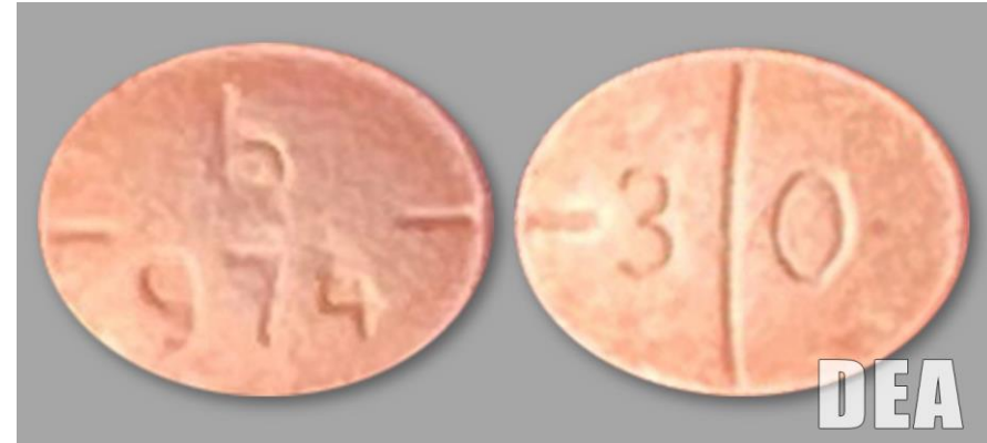
Counterfeit Adderall® 20mg