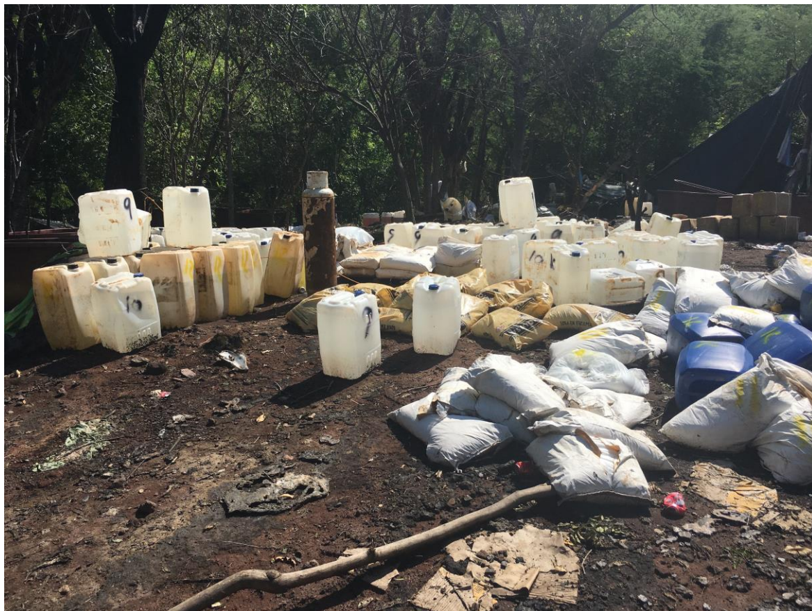
Clandestine Counterfeit Pill Making