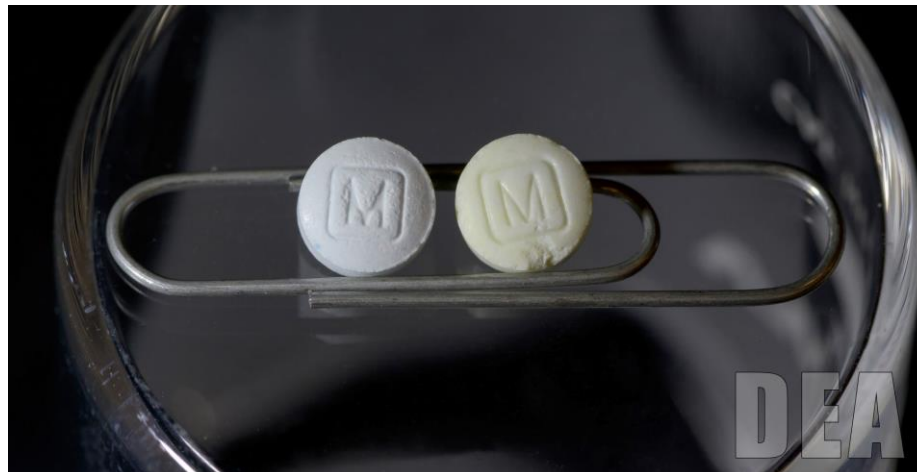
30mg Oxycodone – Which one is authentic?