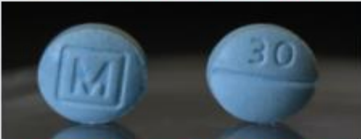
*Counterfeit oxycodone M30 tablets containing fentanyl