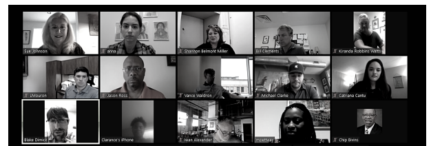
BBBS has been keeping connected through virtual means!

Visit www.mentorallittle.com for more information.