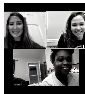
A new match meeting virtually for the first time.