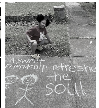
Big & Little play with chalk while staying socially distant.